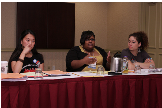
USSA and VT Education Association discuss the importance of access to education with allies and workers.

We are excited about all the connections and relationships that are continuing to be built post-conference and the impact it will have on the SLAP network.