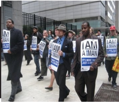
Philadelphia, PA - Workers, clergy, community, youth & students marched through Philly's streets in their campaign to improve working conditions for Philly's security officers with the POWR campaign.

Different organizations, networks and people came together and made connections between their work as part of the same movement for social and economic justice.