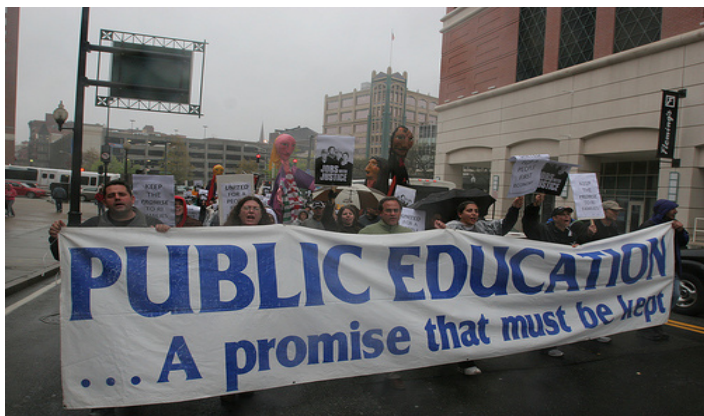
EDUCATION IS A RIGHT Workers & Students Unite for Justice!

Special thanks to our allies and all the students doing the work every day on their campuses and communities for taking the time to share their stories and grow with us.