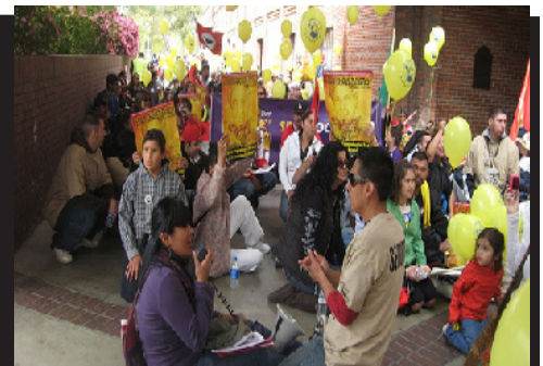
Sacramento, CA - Students, workers, labor and community members did a sit-in to call attention to the effort of Blue Diamond workers trying to organize with the ILWU during their Cesar Chavez march.

We took it to decision makers and kept the pressure on them through the various actions in different cities